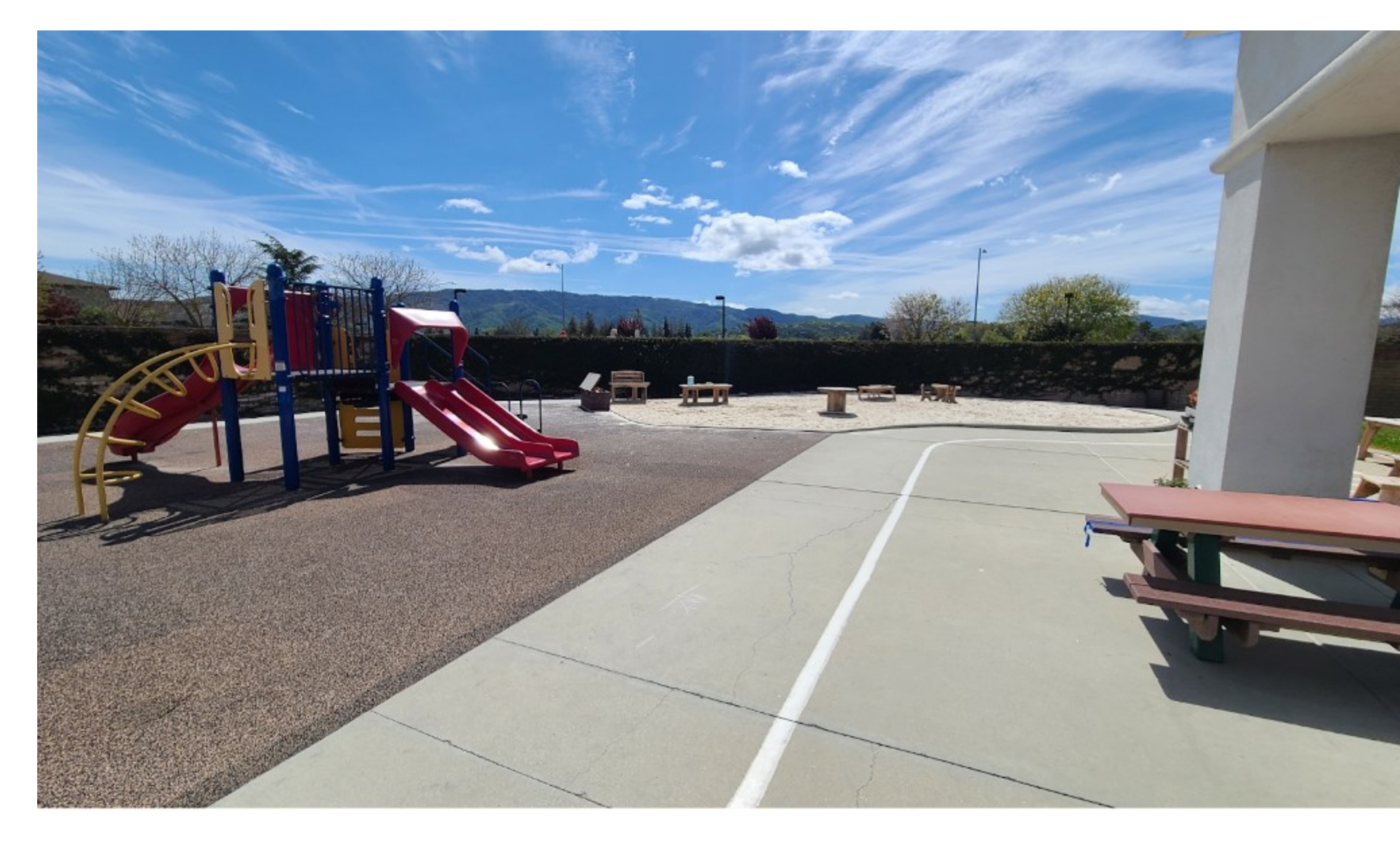
Existing play space which radiates heat. We will add vines to reduce heat and sound and green space.