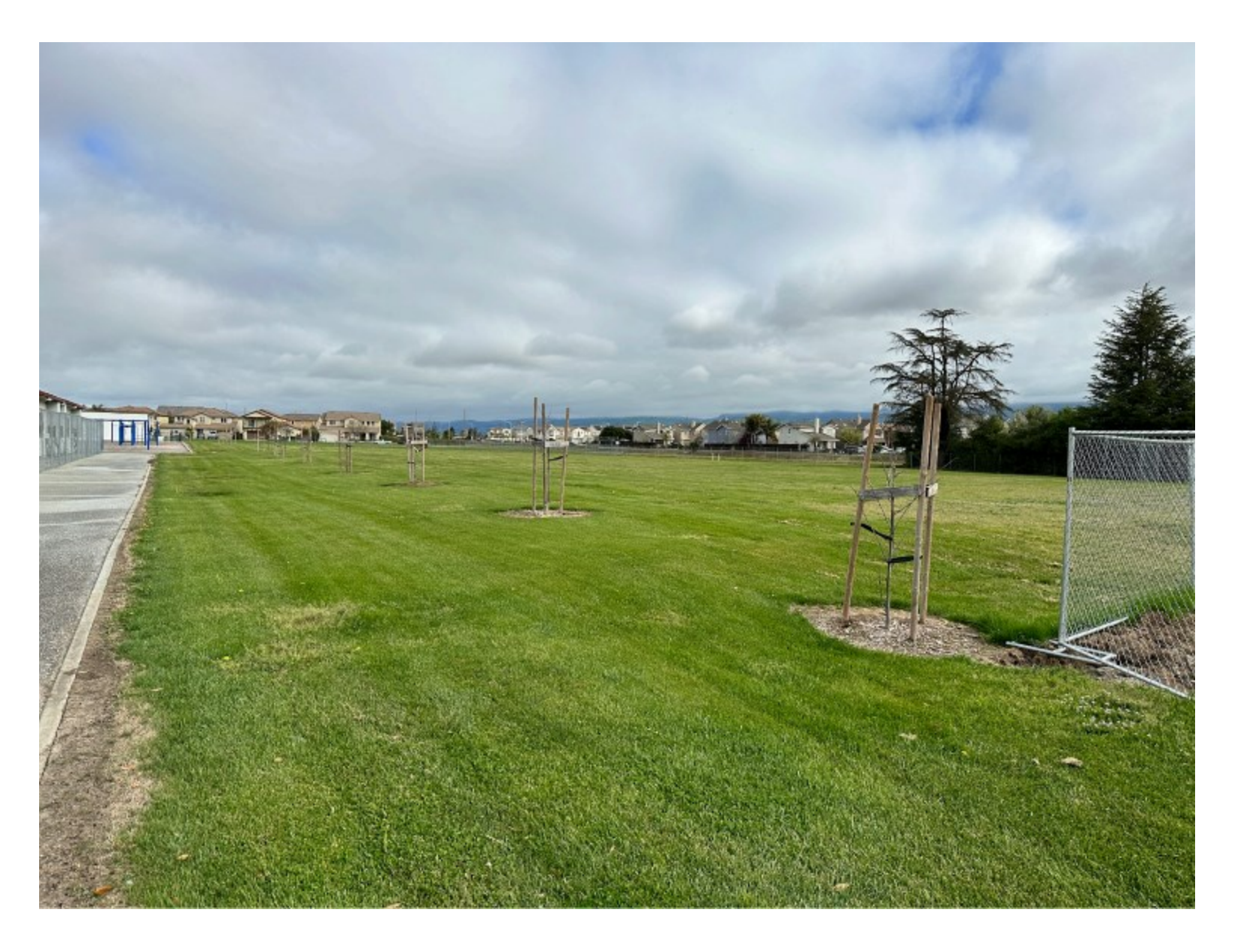
Area we would like more trees for shade.