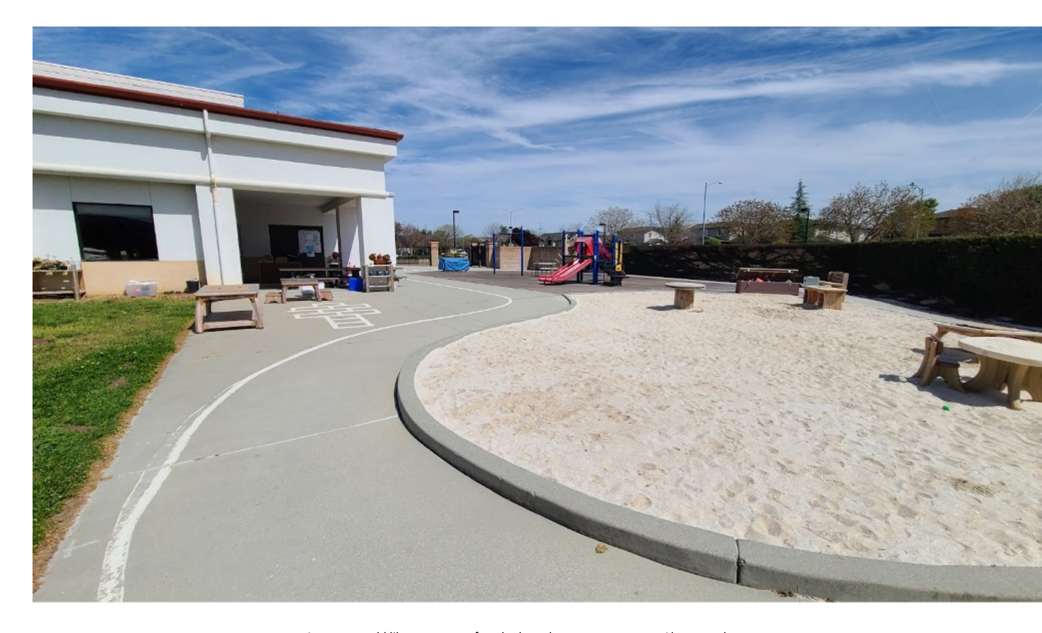
Area we would like more trees for shade and create a grass area. Also a mud kitchen near present playground.