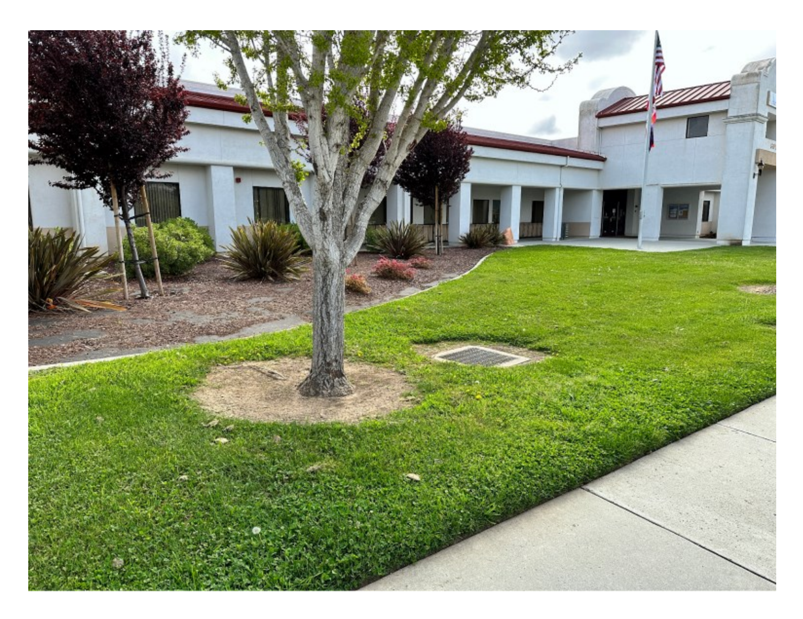
Area we would like more trees for shade.